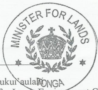
Lord Ma'afu Tuku'aulahi Hon. Minister for Lands Environment Climate Change and Natural Resources.