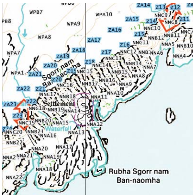
Fig. 2 An example of a detailed bait station map as used by eradication teams during the Isle of Canna operation. Where alphanumeric codes related to bait station positions (e.g. WP = West Plateau, A = line A, 9 = bait station 9; Z = Boundary line Z (two lines of stations at the top of the cliff section above the coastal slopes), 19 = bait station 19; NN = Nunnery, B = line B, 6 = bait station 6), double ended red arrows = safe access routes up or down to the coastal slope areas, pink shaded areas = important archaeological site (e.g. The Nunnery).