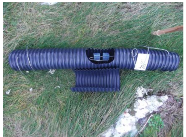
Fig. 4 Example of the main bait station in position showing the open bait station (with the lid off) with the bait wired in place, as used in the five ground-based eradications in the United Kingdom that were directed by Wildlife Management International Ltd.

Although aerial application operations generally have a range of higher implementation costs compared to ground-based operations due to the requirement of a helicopter, sowing bucket and need for ground crew, engineer and other legal requirements for use of aircraft, the implementation time of the operation is often reduced compared to a ground-based operation. Except for the Lundy Island eradication (which took a second winter),