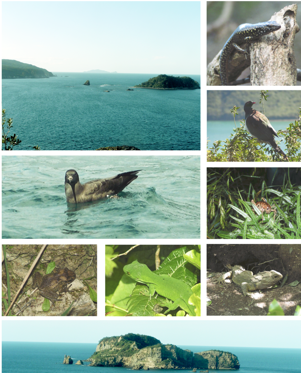
PLATE 1. New Zealand island ecosystems (top left and bottom) house a vast number of endemic species (clockwise from top right: Whitaker's skink, Cyclodina whitakeri ; New Zealand Pigeon, Hemiphaga novaeseelandiae ; Giant weta, Deinacrida rugosa ; Tuatara, Sphenodon punctatus ; Green gecko, Naultinus elegans ; and Maud Island frog, Leiopelma pakeka ) that often critically depend on seabird nutrient inputs from (middle left) Sooty Shearwater, Puffinus griseus , and/or the absence of invasive rats for survival. Most of these species are unable to survive on islands with invasive rats but can recover or be actively reintroduced following rat eradication.

on islands that were never invaded by rats. Given that many seabird species have low reproductive rates, and are subject to Allee effects, vagaries of food availability, and climate change, their slow recolonization may delay complete recovery, making my prognosis somewhat optimistic. Indeed, if the N pools on never-invaded