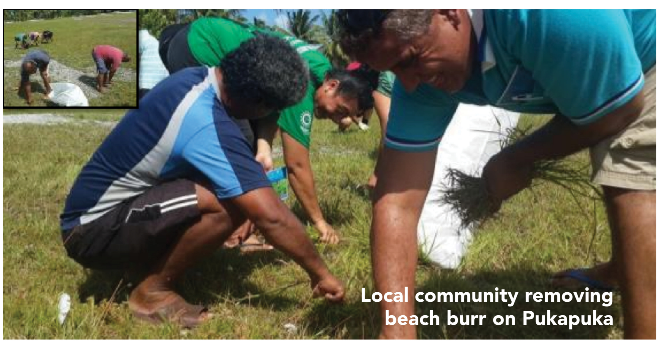
Local community removing beach burr on Pukapuka

Beach Burr was first discovered in recent years on Motu Kotawa. In May 2015, this invasive weed had spread to nearby Motu Ko and Pukapuka's main island, Motu Wale.