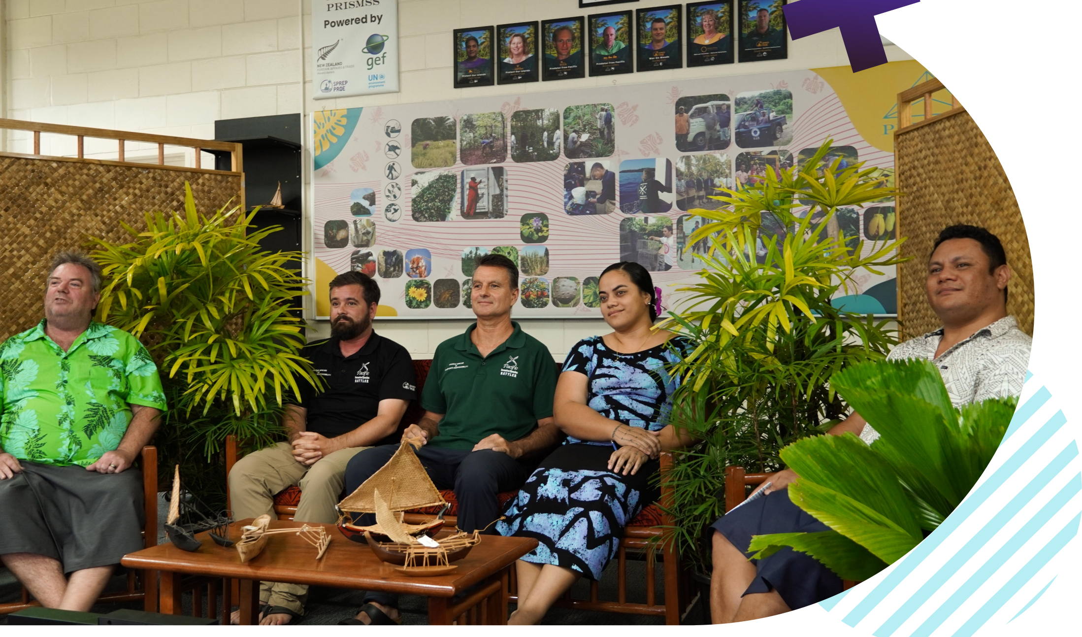
SPREP Invasive species team in the battler lounge hosting the final SPREP webinar for 2021

Welcome to 2022. Your PRISMSS team has continued to progress the development of systems and processes to improve assistance to the Pacific for the five PRISMSS programmes. These systems will allow for streamlined requests and assistance with PRISMSS partners, the storage and retrieval of country specific and programme specific information and allow for analysis at a greater and more beneficial level for countries, PRISMSS and donors.