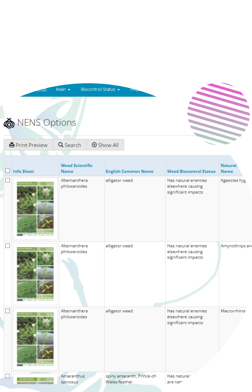
NENS Online Database is now live!