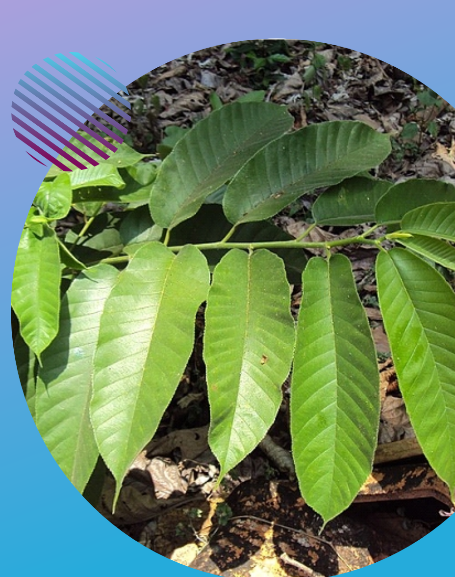
Panama rubber tree ( Castilla elastica ) - a deciduous latex-producing tree significant threat to native forest ecosystems

The Department of Environment team received training from the PRISMSS War on Weeds programme, in the use of a data recording tool called Fulcrum. This application enables the team to record data in the field from their phones. The use of Fulcrum is funded by the GEF6 Regional Invasives Project.