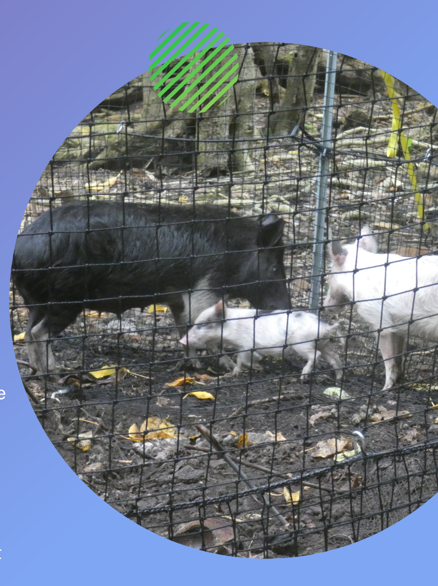
Pigs on Faioa islet, Wallis and Futuna

With restoration works already underway in Tonga, RERC programme now looks to extend its portfolio this year under the GEF6 RIP with virtual consultations already kicking off for Tuvalu, Republic of Marshall Islands (RMI), and Niue. The main purpose of the consultations is to explore and identify priority sites for restoration. A key aspect of this is collecting data and information to assist with the development of operational plans for the three countries.