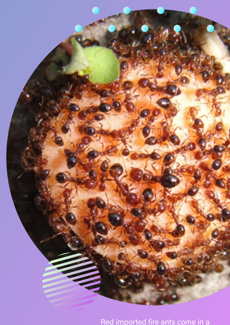
Red imported fire ants come in a large range of sizes.

Another priority across the region for prevention and management is Coconut Rhinoceros Beetle (CRB). SPC has produced a CRB manual .