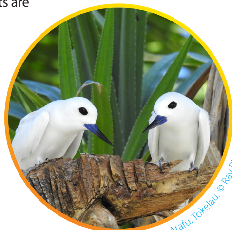
White terns on Atafu, Tokelau.

Because effective international and domestic prevention (of arrival, establishment, and spread) is the most cost-effective way to manage invasive species, these actions contribute directly to maximising climate resilience.