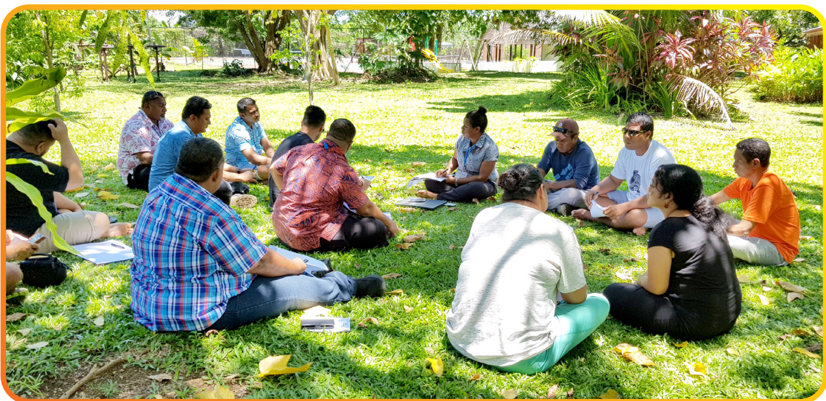
"South-south" sharing of knowledge from around the region to benefit everyone.