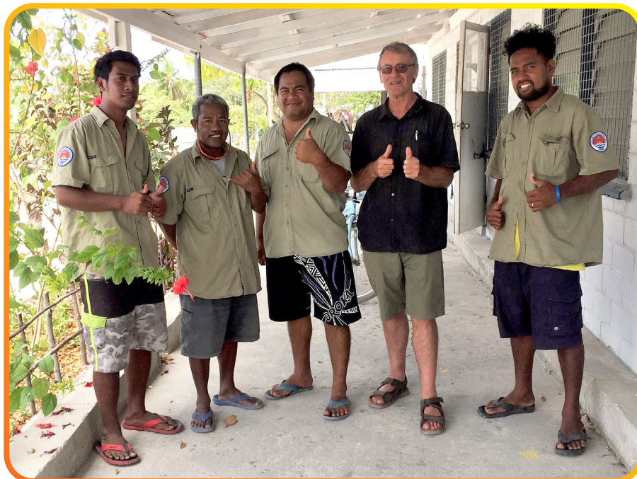
Line Islands visit with Environment officers from Kiritimati. A protect our Islands buddy can support local teams with awareness-raising in outlying communities.

The skills of the Protect our Islands buddy, and the amount of time they need to spend in-country, will depend on the needs of the country. The need might be as simple as an extra staff member to reduce overwork for a few months, or run biosecurity workshops, or a specialist in control of a specific pest several times a year over a few years. In all cases, the buddy would provide advocacy support to government agencies, communities, and other interest groups to increase understanding around the need for well-supported biosecurity/quarantine teams. Contact PRISMSS for more information about the buddies.