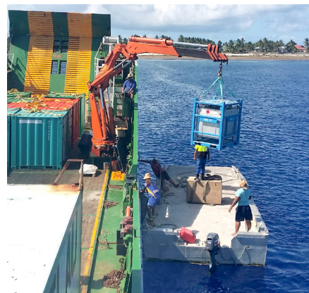
Left: Show days help increase biosecurity awareness. Right: Avoiding contact between ship and shore, using a barge to offload is good biosecurity practice.