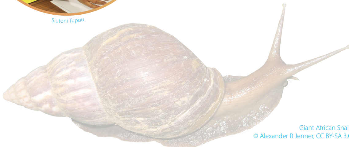
Giant African Snail.